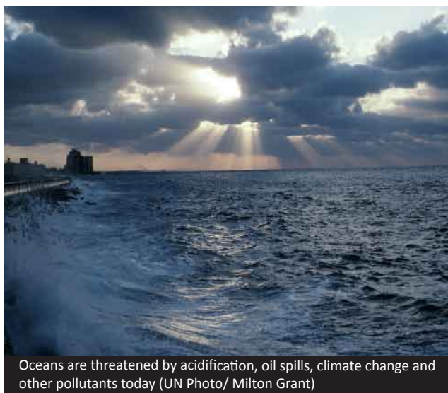
Oceans are threatened by acidification, oil spills, climate change and other pollutants today