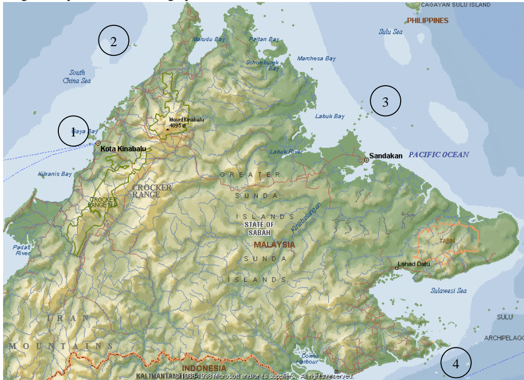
Fig 2: Map of Sabah showing operational locations

Parks authority (1). Ease of access to town will allow meetings with counterparts, other agencies and officials to take place in parallel, as well as allow quick solutions to simple technical problems. After 7-10 days the system will be transported to the Mantanani Resort in Northwest waters near Shell Sabah’s oil rigs (2). Boat operations will be based at the resort for 7 days. The region surrounding the Mantanani islands is known to suffer significant fish blasting based on reports from the dive resort. Further locations on the East side of Sabah (Lankayan resort (3) or Semporna area (4)) will also be monitored, with access to boats and the support of local dive resort management. A final phase of data analysis, report writing, consultation and gathering of feedback from counterparts will take 7 days back in Kota Kinabalu.