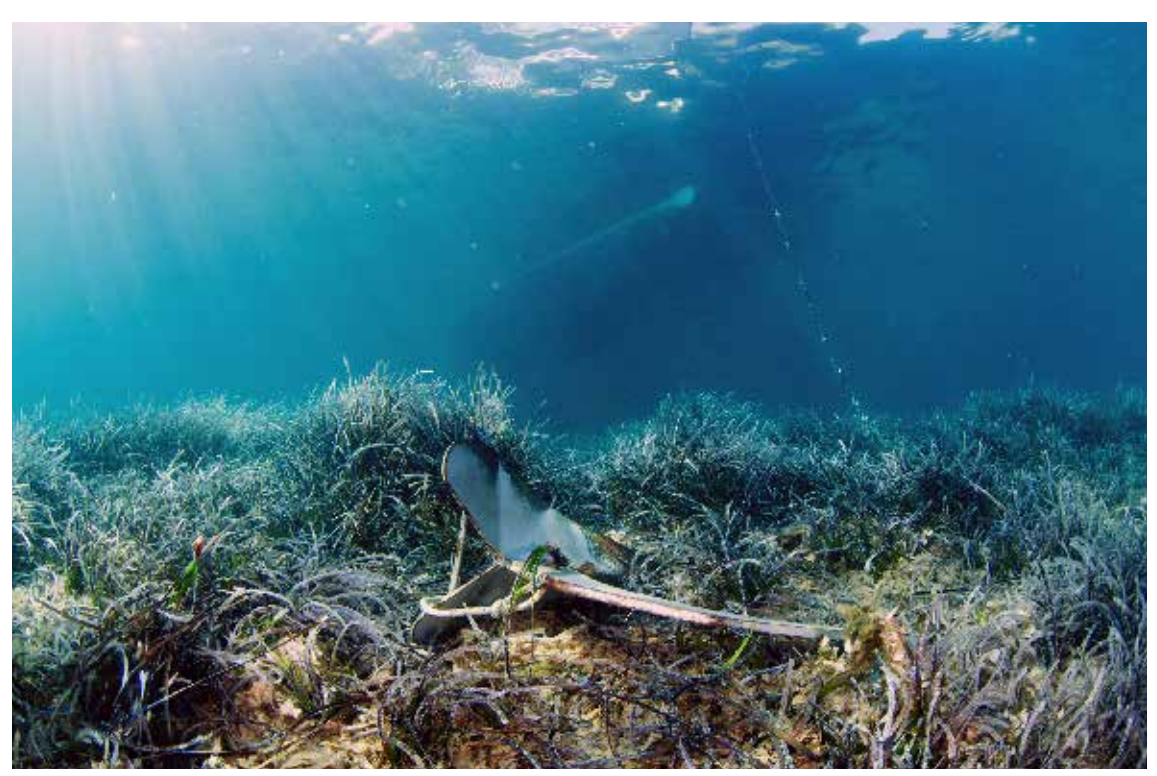
Figure 5. Boat anchor lodged into a seagrass bed.

algal beds to be US$6.4 trillion (out of a total for all ecosystem services of US$125 trillion). Hence in this analysis seagrass and related habitat (algae) is responsible for > 5% of the total value of nature. Whilst monetizing values in this way may help to communicate the importance of nature in some policy settings it is important to remember that it also fails to capture total value and is inherently biased against people with little money. For example, in mangroves, whilst the market value of fuelwood might be very low, thousands of poor households rely on collecting it to cook their daily meals (Huxham et al., 2015).