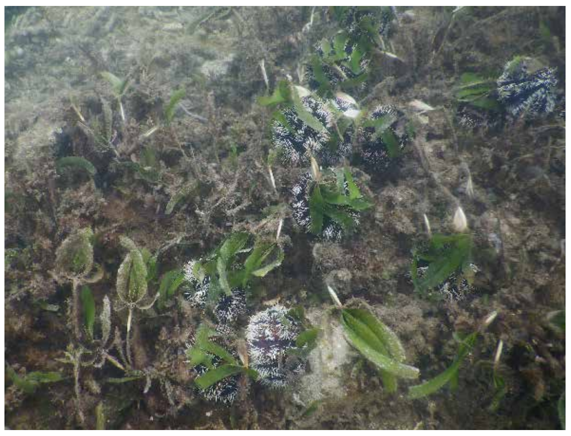
Figure 3. A degraded seagrass meadow due to predation by sea urchins.

of the global rate of loss of seagrass meadows is challenging due to a lack of a global database. Their annual rate of decline has been estimated to be as high as 7% (Waycott et al., 2009), based on a global data set which draws heavily from developed countries. An estimate of 6.9% loss per annum was made for the Mediterranean (Marbà et al., 2014) and more recently 1.59% in Kenya (Harcourt et al., 2018). Hence it is clear that seagrasses globally are suffering rapid declines but that the rates of loss vary widely. Whilst their rate of loss and ecological importance matches or exceeds other ecosystems such as mangroves, coral reefs and terrestrial tropical forests, seagrasses are relatively marginalised due the low public awareness of their value; this is arguably the greatest threat to their conservation (Nordlund et al, 2018).