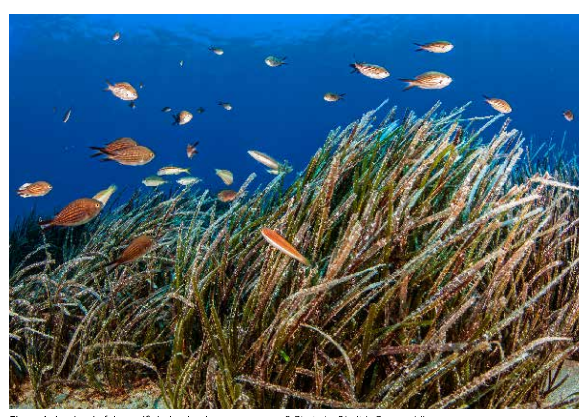
Figure 1. A school of damselfish dominating seagrasses.

Seagrasses are flowering plants (angiosperms) that form 'meadows' in intertidal to shallow subtidal coastal waters around the world. Their global extent is conservatively estimated at 300,000 km² although challenges in assessment of seagrass cover, and the resulting absence of a global, regularly updated database of seagrass meadows, mean that this figure is acknowledged to be approximate and their actual extent may be 600,000 km² or more (Green and Short, 2003; Mcleod et al., 2011). They deliver a range of ecosystem services including carbon sequestration, nursery habitats for fish and shellfish (including commercially exploited species) and coastal protection through hydrodynamic damping (Nordlund et al., 2017). They provide a food source for numerous species, including charismatic fauna such as sea turtles, manatees and dugongs, which in turn attract marine tourism. Seagrasses are closely ecologically linked with other coastal habitats such as mangroves and coral reefs in the tropics, and tidal marshes and kelp forests in temperate areas (Huxham, et al., 2018).