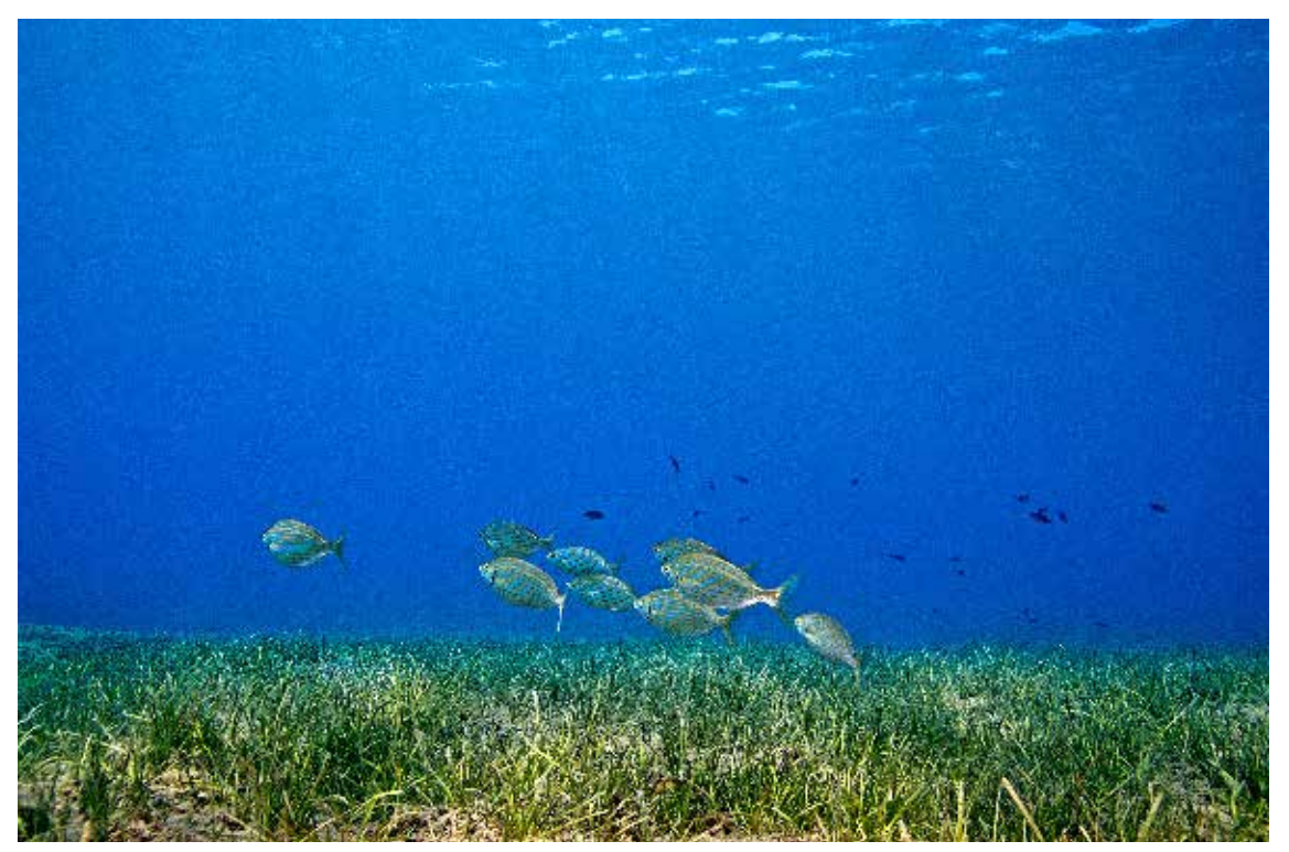
Figure 7. A school of cow bream (Salema porgy) swimming on a seagrass bed.

of seagrass meadows to local fisheries in line with the requirements of a PES program.