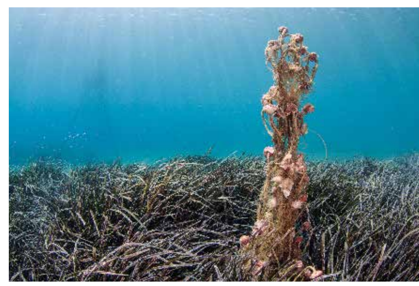
Figure 4. Abandoned fishing gear entangled on a seagrass patch.

pressure on the relevant authorities to enforce breaches of legislation. Seagrass meadows are rarely considered in marine planning and management strategies (Nordlund et al., 2016) and where management strategies do exist, enforcement is often lacking. Due to their shallow coastal location, seagrass meadows often overlap with direct human use such as seine netting, anchoring of boats and marine recreational activities, as well as with areas of