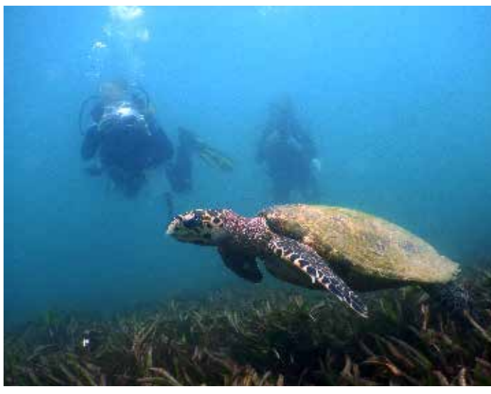
Figure 2. Scuba divers enjoying a sea turtle on a healthy seagrass meadow.

Seagrass meadows are disappearing rapidly (Waycott et al., 2009). Eutrophication, increased sedimentation from land erosion, coastal development, climate change and impacts from boats, anchors and fishing gear are all important drivers of loss (Cabaco et al., 2008; Short et al., 2016; Fernandes et al., 2017). Accurate estimation