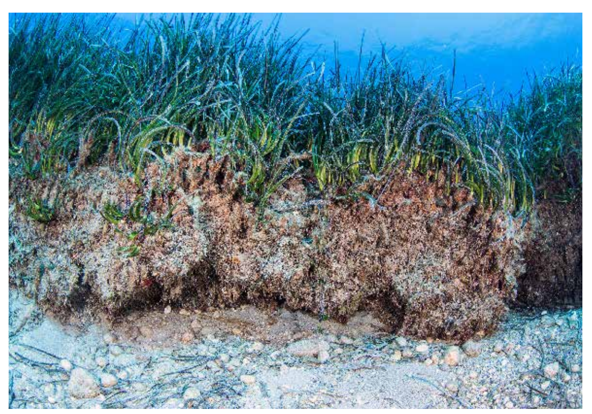
Figure 6. Exposed rhizomes and matte of Posidonia meadows.

While terrestrial forests have traditionally been the focus of global ecosystem carbon budgets and sequestration schemes, wetlands and marine ecosystems are increasingly recognised as valuable carbon sinks, in many cases storing